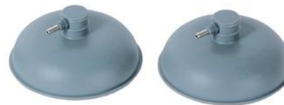
3444504 Ø 90 mm