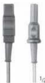
MARTIN / BERCHTHOLD XR 830/03 300 cm