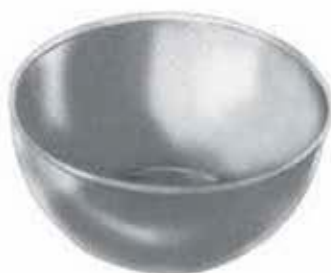
KU 300/11 Ø x h 116 x 50 mm 0,35 l