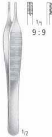
ADSON-BROWN AB 116/09 12,0 cm/4 3 / 4 "