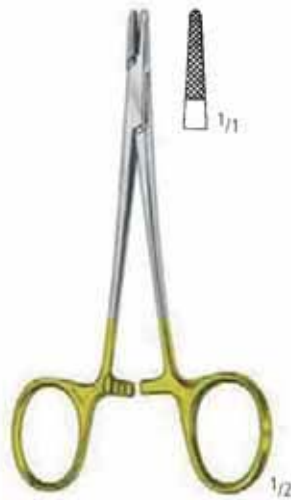
HALSEY AE 466/13 13,0 cm/5"