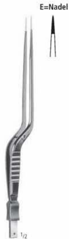
XR 894/16E 16,0 cm/6 1 / 4 "