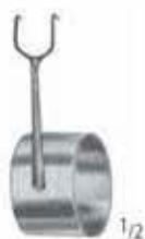
COTTLE (MILLARD) KO 409/00