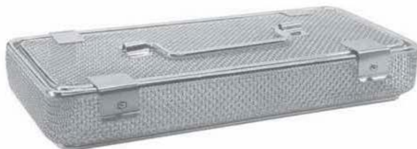
KYE 304/50 L(mm) B(mm) H(mm) 267 125 50