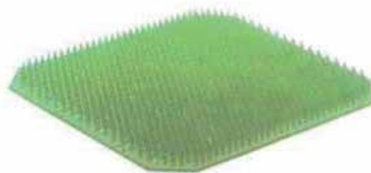
KYE 810/01 L(mm) B(mm) 275 125