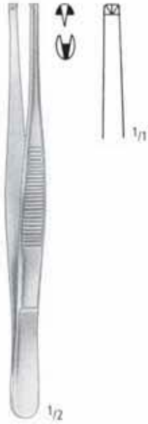
STANDARD 1:2 AB 060/16 16,0 cm/6 1 / 4 "