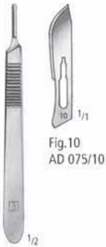
AD 010/03 No. 3