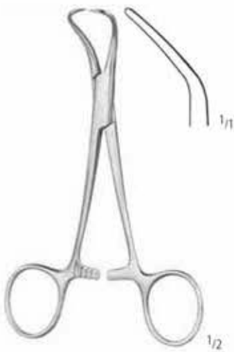
BACKHAUS AA 751/13 13,0 cm/5"