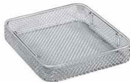
L(mm) B(mm) H(mm) 255 245 50 SK 105/05