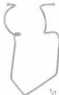
BARRAQUER PHAKO KP 154/04 4,0 cm/1 1 / 2 "