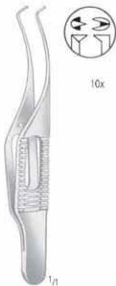
BARRAQUER-KATZIN 1:2 (Colibri) AB 750/07 7,0 cm/2 3 / 4 "