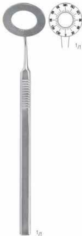
MENDEZ KP 547/11 11,0 cm/4 1 / 2 " C 10°, 0 -180°