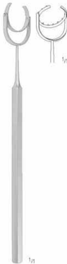
THORNTON KP 550/12 12,0 cm/4 3 / 4 " Ø 13 mm