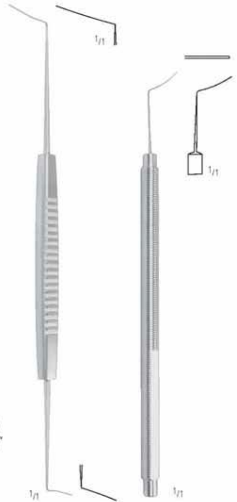
CASTROVIEJO KP 487/14 13,5 cm/5 1/4" 0,5 x 10/16 mm