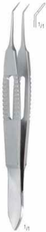
McPHERSON AB 819/02 10,0 cm/4"