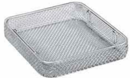
L(mm) B(mm) H(mm) 255 245 50 SK 105/05