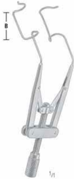
LIEBERMAN KP 210/02 8,0 cm/3 1/4" B = 15 mm