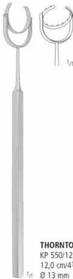
THORNTON KP 550/12 12,0 cm/4 3/4" Ø 13 mm