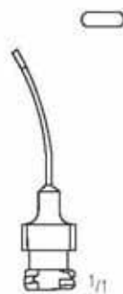
SAUTTER KP 731/27 3,5 cm/1 1/2" 27G