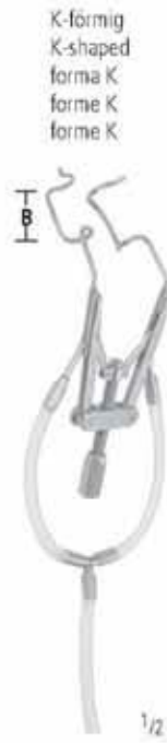
LIEBERMAN KP 211/08 8,0 cm/3 1/4" B = 15 mm