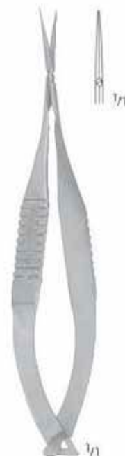
GILLS-WELSH AC 779/01 8,5 cm/3 1 / 2 "