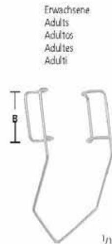
BARRAQUER-COLIBRI B 15 mm KP 150/15 4,0 cm/1 1 / 2 "