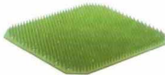
L(mm) B(mm) 275 125 SX 432/01