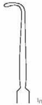
GRAEFE KP 015/01 13,0 cm/5" Fig. 1