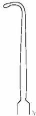
GRAEFE KP 015/03 15,0 cm/6" Fig. 3