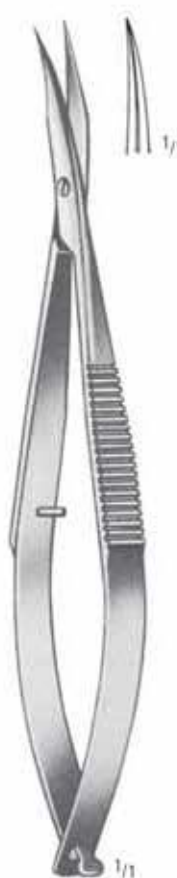
WESTCOTT AC 780/11 11,0 cm/4 1 / 3 "

spitz pointed agudas pointues acuta gebogen curved curvas courbes curve