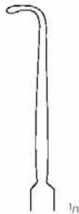
GRAEFE KP 015/02 14,0 cm/5 1/2" Fig. 2