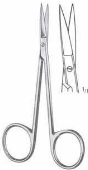
AC 450/10 10,5 cm/4 1 / 4 "

Irisscheren Iris Scissors Tijeras para iridectomía Ciseaux à iridectomie Forbici per iridectomia