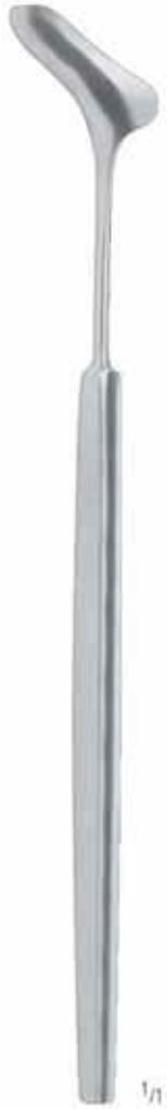
ARRUGA KP 262/13 13,0 cm/5"