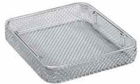
L(mm) B(mm) H(mm) 255 245 50 SK 105/05

Set komplett Set complete Juego completo Jeu complet Set completo