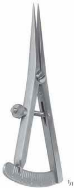
CASTROVIEJO AR 282/20 8,0 cm/ 3"

Messbereich 20 mm measuring range 20 mm campo de medición 20 mm étendue de mesurage 20 mm ampiezza di misura 20 mm