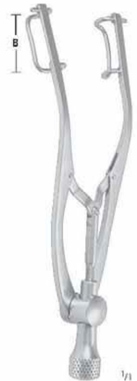
CASTROVIEJO KP 175/09 9,0 cm/3 1/2" B = 16 mm