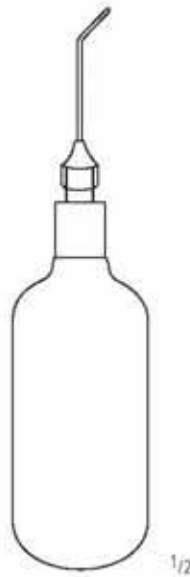
BISHOP-HARMON KP 700/00

Set komplett Set complete Juego completo Jeu complet Set completo