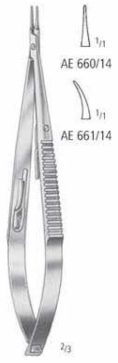
CASTROVIEJO 14,0 cm/5 1 / 2 "