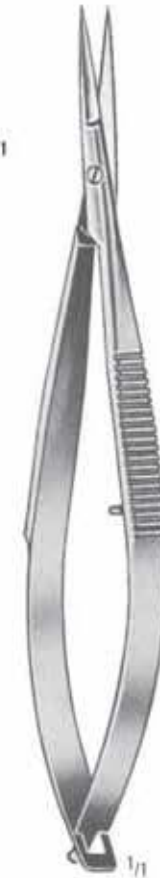
WESTCOTT AC 797/01 11,5 cm/4 1 / 2 "