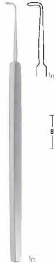
STEVENS KP 018/12 12,0 cm/4 3/4"