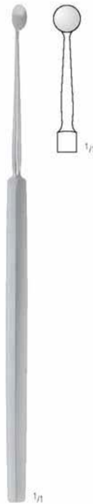
BUNGE KP 400/01 14,0 cm/5 1/2"