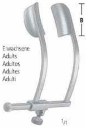
COOK B 15 mm KP 200/15 5,0 cm/ 2"