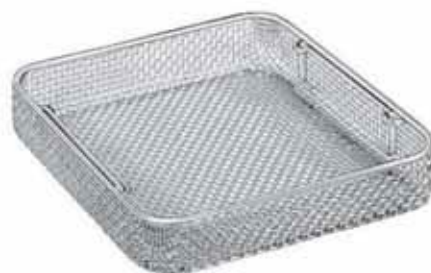
L(mm) B(mm) H(mm) 255 245 50 SK 105/05